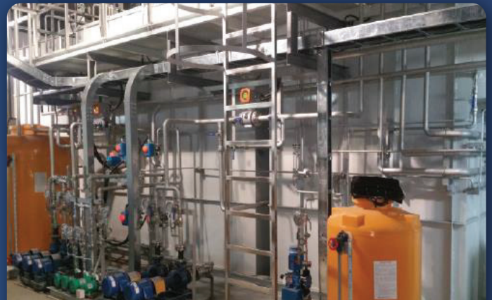
SEWAGE TREATMENT EQUIPMENT