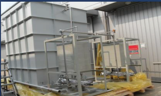
SEWAGE TREATMENT EQUIPMENT